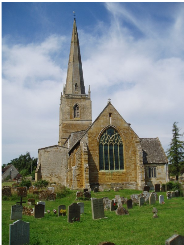
ST GREGORY'S TREDINGTON

ILMINGTON PRESTON-ON-STOUR ATHERSTONE-ON-STOUR STRETTON-ON-FOSSE – DITCHFORD TREDINGTON–DARLINGS COTT–WHITCHURCH